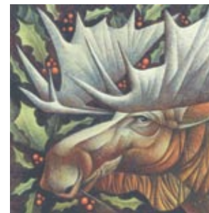
SEASON'S GREETINGS FROM COTTAGE COUNTRY

MAKING ELECTRONIC MEDICAL RECORDS A REALITY The Province is taking a leading role in bringing the world's most advanced medical records system to the province. The Ontario Health Quality Council reports that health care professionals are using electronic medical records to improve patient care. The Province is currently seeking individuals to fill several positions. For more information, please contact the Human Resources Department at 1-888-262-0436 or visit our website at www.wpshtcf.com.